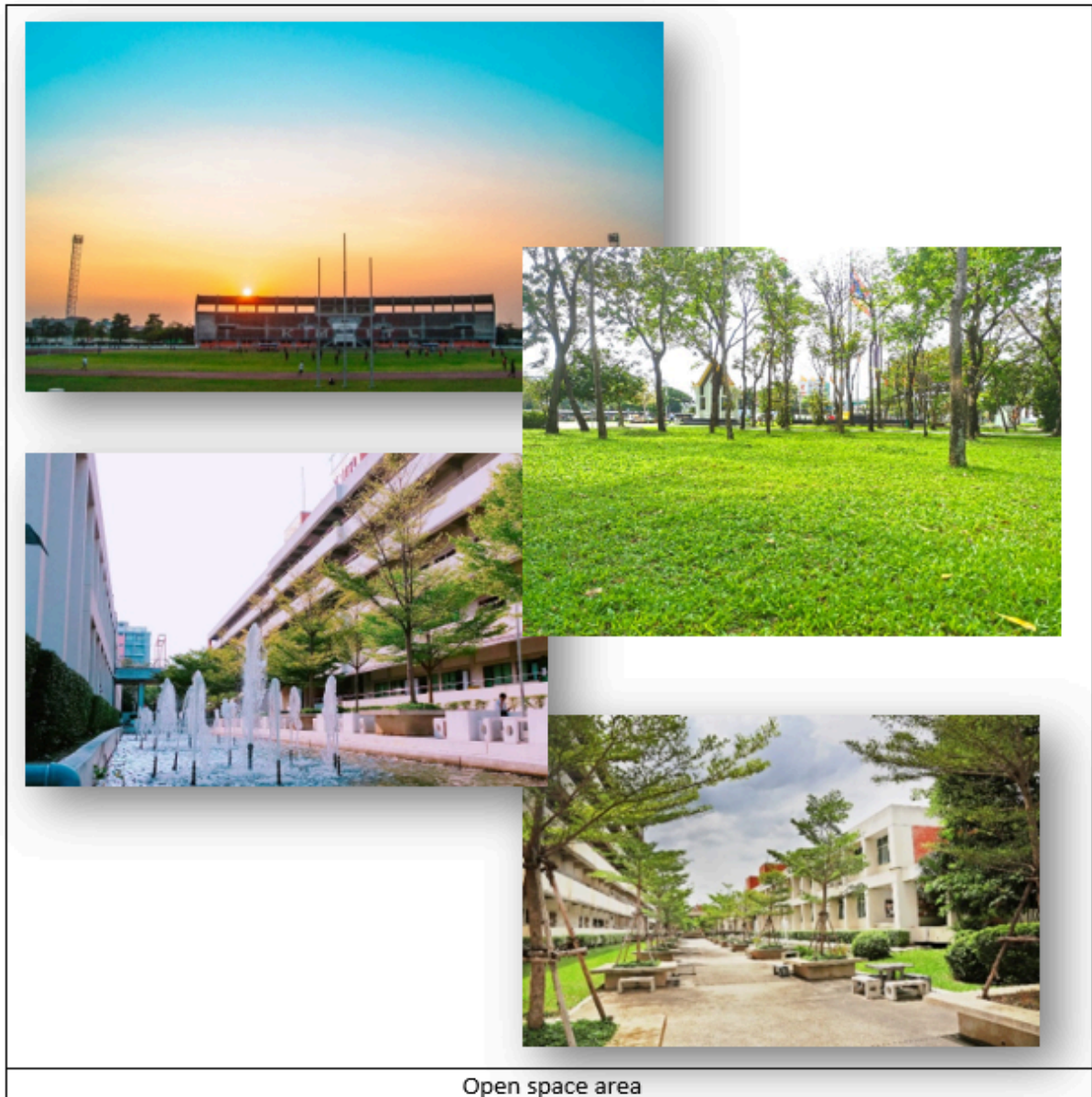
Open space area